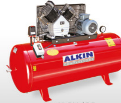
22-530 / 5,5