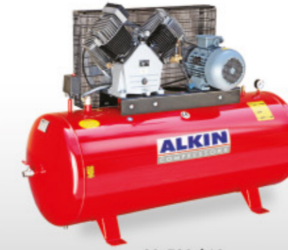
22-530 / 10