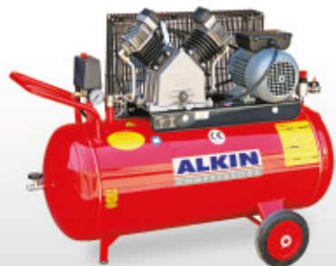
21-100 / 21-100M