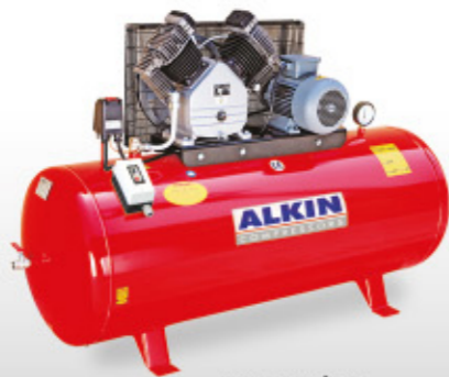
21-530 / 7,5